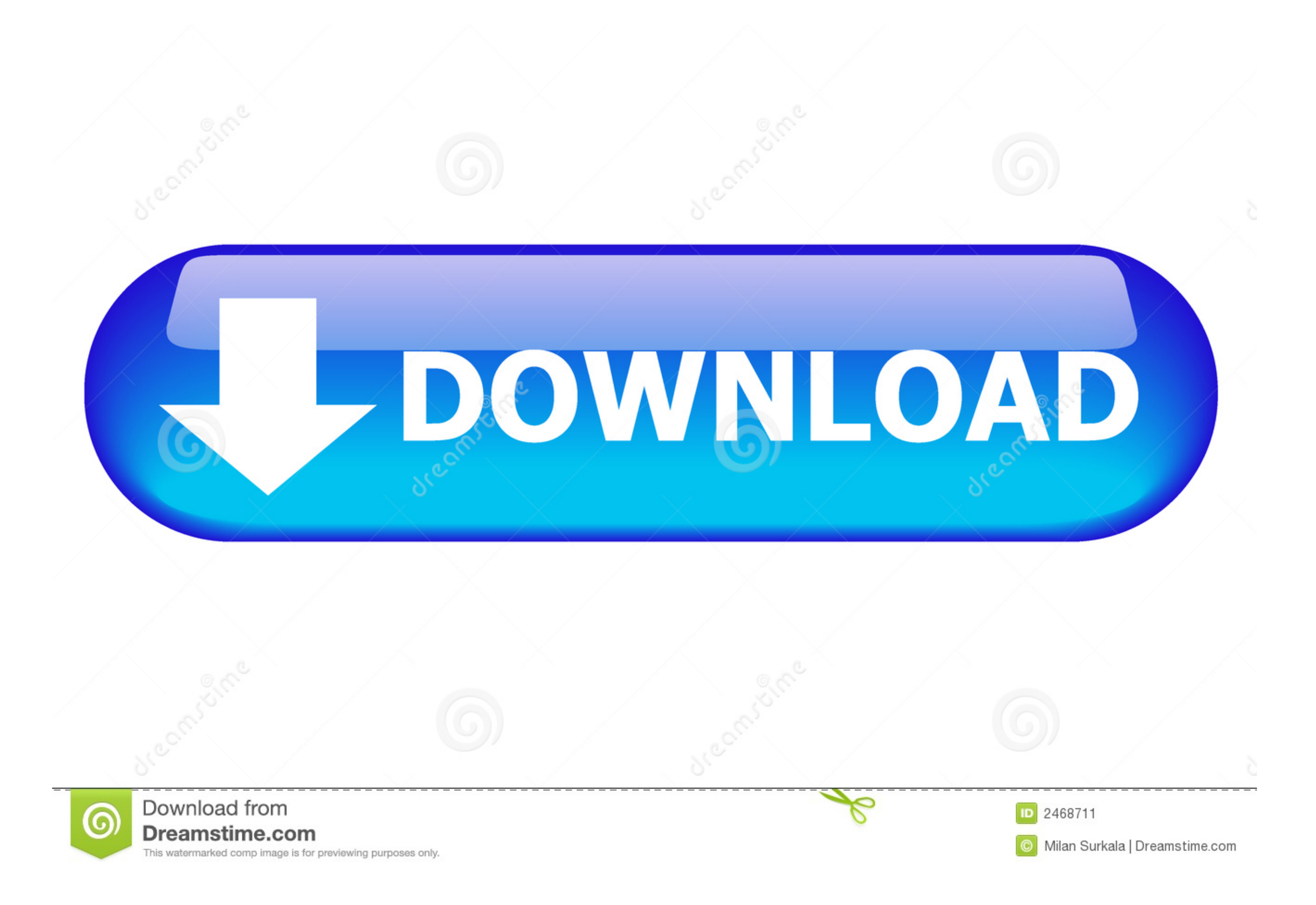
Earmaster Pro 6 Mac Torrent Down